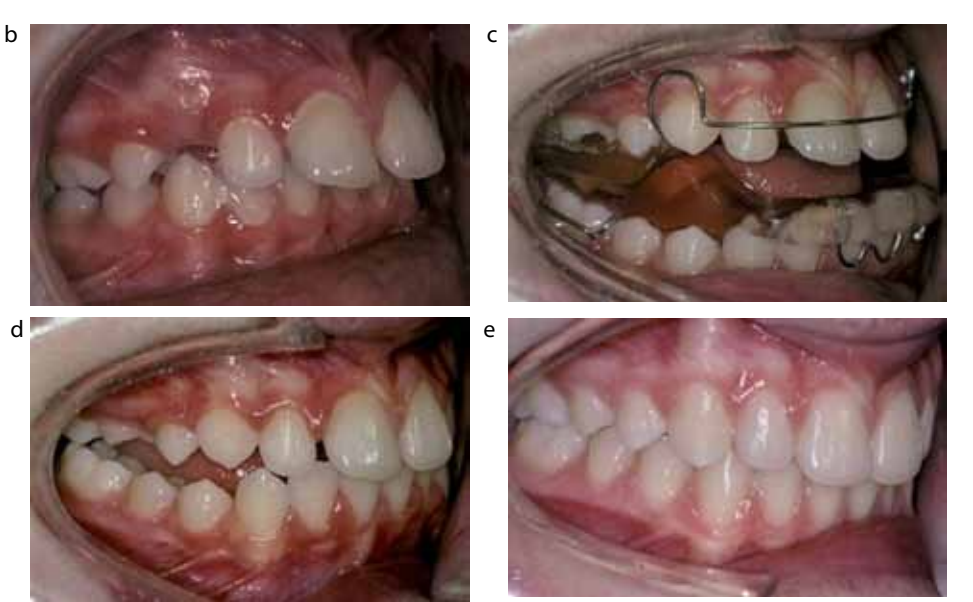
Figure 1. An example of a case successfully treated with the Twin-block: (a) pre-treatment facial profile; (b) pre-treatment overjet; (c) Twin-block appliance in situ ; (d) post-functional overjet correction; (e) final occlusal result on completion of fixed appliance therapy and (f) post-treatment facial profile.